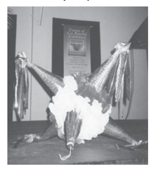
Dozens of at-risk youth submitted scores of original artwork – like this piñata from Camp Munz and Camp Mendenhall – which was inspired by Chávez' life and work.

In addition, staff from the three juvenile halls hosted basketball clinics and life skills workshops for youth at Athens