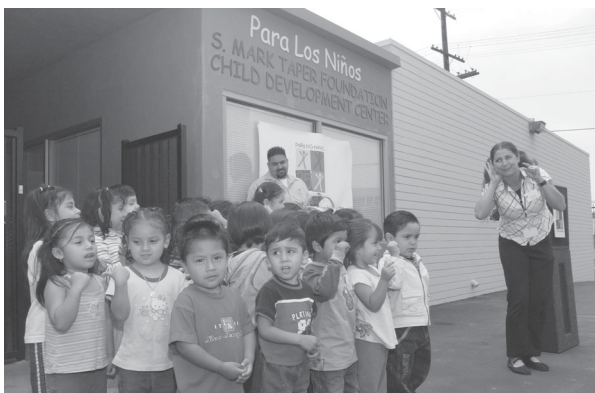
Children attending preschool at Para Los Niños entertain attendees at the dedication ceremony.

Los Angeles County with a high population density are the same areas that lack extra land to situate new facilities. To make matters more difficult, it is in these areas that we lack enough providers to offer services. Yet, all the research has shown that children who participate in preschool are much more likely to succeed in school and go on to attain higher education.”