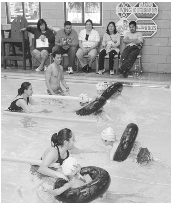
Children from the Centro Estrella preschool participate in an aquatics competition as their parents look on.

Centro Estrella even boasts a special aquatics facility featuring water therapy equipment for children with special needs. Over time, the pool’s purpose has evolved and it now functions as a site for “Mommy & Me” classes, senior exercise programs and swimming classes for youth. Each day, 23 youngsters enjoy the good fortune of receiving their preschool education and swimming lessons at the same location.