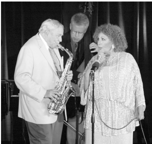
Cleo Laine and the John Dankworth Group