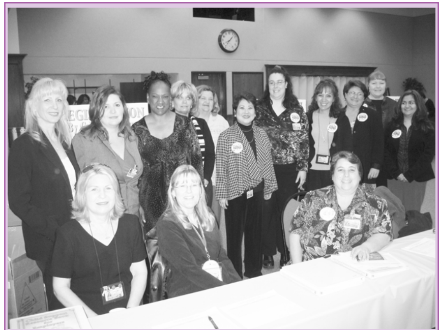
Staff from CSSD staged the Palmdale Workshop in March