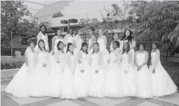
The 4 th annual Multicultural Quinceañera Court at the Carson Community Center.