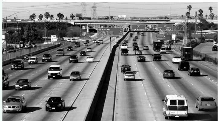
Traffic hums along the San Bernardino Freeway approaching the 10-605 Freeway interchange in Baldwin Park.”