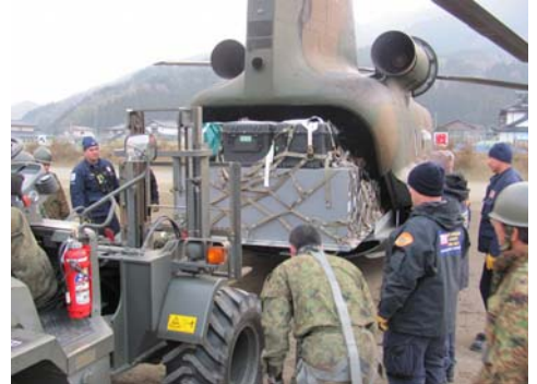
Pictured above are Los Angeles County Fire Department's Urban Search and Rescue Team, California Task Force 2 in Japan searching for survivors following the 9.0 magnitude earthquake and subsequent Tsunami.